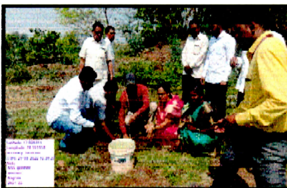
Hon. Principal and dignitaries planting trees on last day of NSS camp at Nagrale