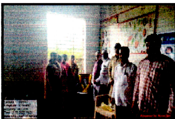
Dignitaries offering tribute to Padmbhushan Karmveer Dr. Bhaurao Patil