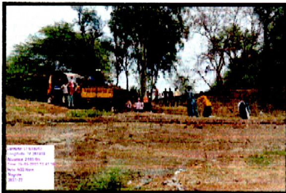
A team of NSS volunteers filling up leftovers of food into trolley container