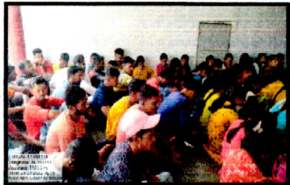
NSS volunteers present during guest lecture