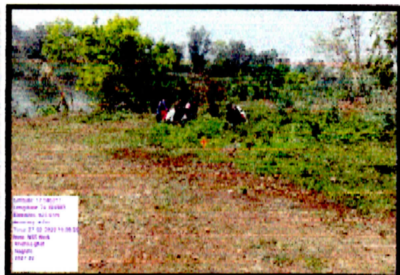
NSS volunteers cleaning weeds on bank of river Krishna.