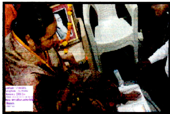
Local ladies were benefitted with health camp organized in NSS camp