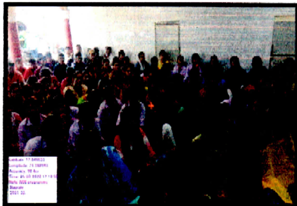
NSS volunteers present for the guidance session