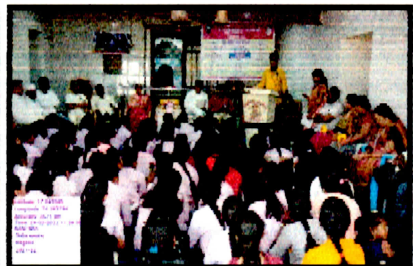
Students expressed their feelings on the last day of camp during valedictory function.