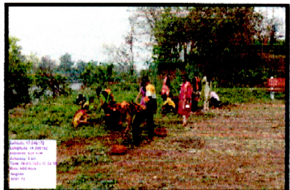
Another Team of Volunteers cleaned herbs and grass from the cremation ceremony area