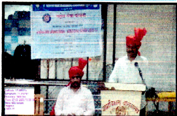
Guest lecture on evening session of Day 5.