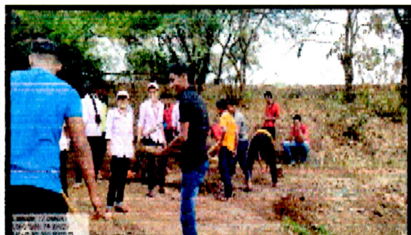
NSS volunteer cleaning dirt collected on stairs due to 2019 floods of Krishna River Bank at Nagrale during morning session.