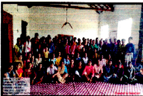
A click with all dignitaries present in the camp during a fine afternoon.