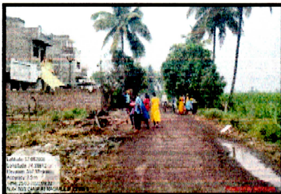
NSS volunteers cleaned roads, Schools and temple in Nagrale on day 2 of camp